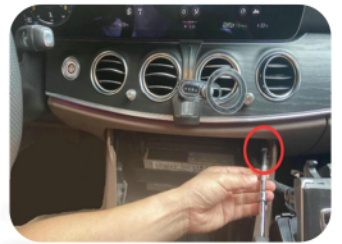
8.Remove the right trim panel fixing screws