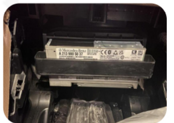
16.After the decoder is installed, screw the original main unit in place