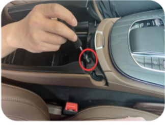
1.Remove the armrest box screws