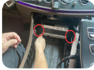
6.Remove the two screws of the original main unit