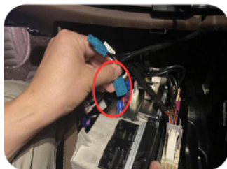
13.One end of the decoder's LVDS cable connect to the car's main unit.