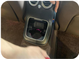
9.Pry off the rear seat cup holder spacer with a buckboard