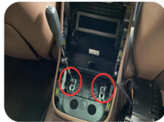
11.Remove the water cup holder and take two more retaining screws