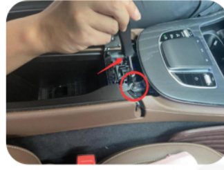
3.Remove two screws from the control board