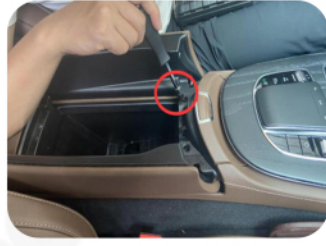
2.Remove the armrest box screws