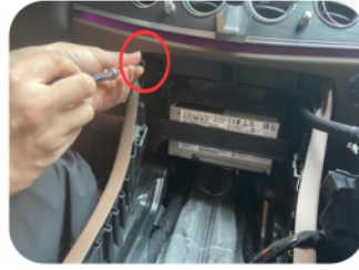
7.Remove the left trim panel fixing screws