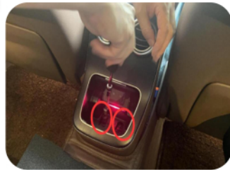
10.Remove the two screws of the water cup holder