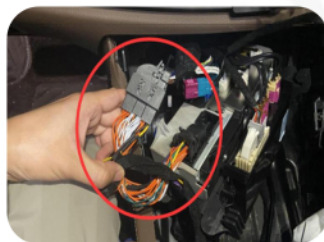
15.Connect the power cord