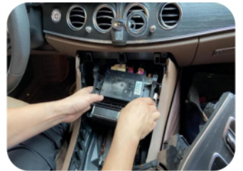
12.Remove the main unit after moving the left and right trim panels