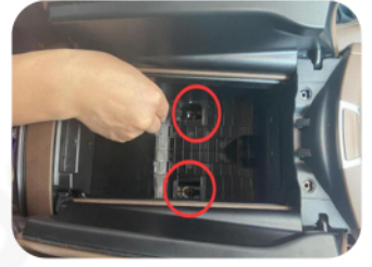
4.Take the two screws in the center of the armrest box