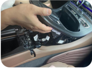
5.Remove the entire control board